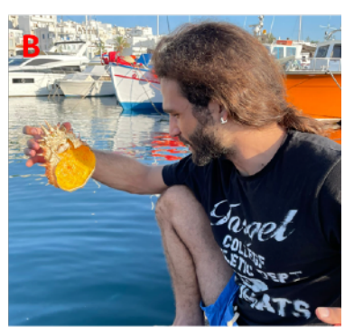
Figure 4: Collecting samples of alien and native species from a marina (A and B).