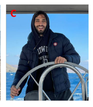
Figure 3: Collecting litter form a beach (A and B) and practicing sailing (C).