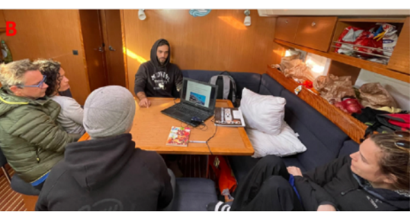
Figure 2: Recording the collected samples (A) and giving lectures on board (B).